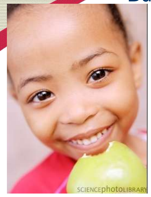
Improving health of European citizens Art.163 of the Treaty

Budget: €6 billion over 7 years (2007-2013)