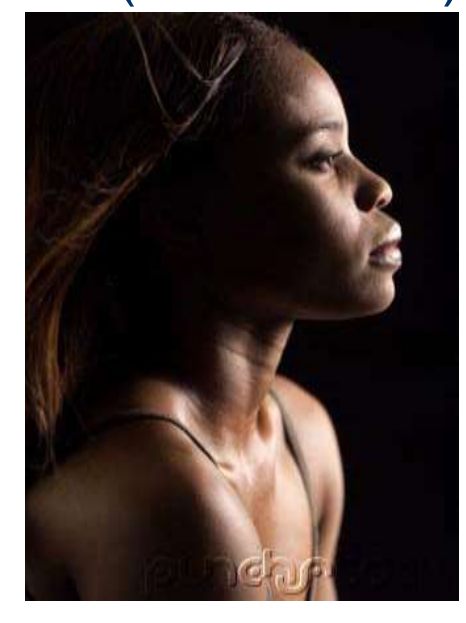
Addressing global health issues, including emerging epidemics