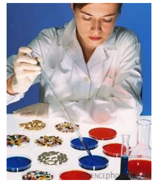
Increasing competitiveness of European health-related industries